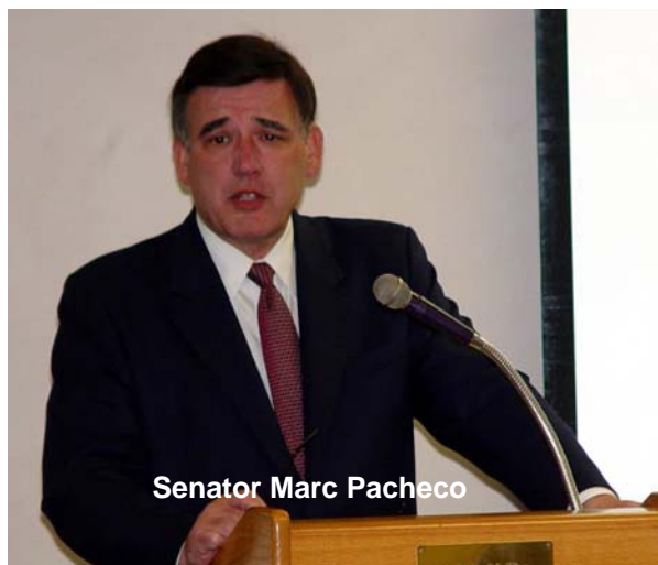
Senator Marc Pacheco